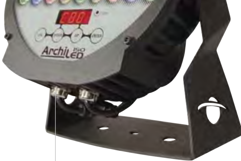
IP 67 main power and DMX cable connection.

Create every kind effects! On request there are three optic kit to make various light beam. Medium beam 23° (standard), narrow beam lenses kit 10°, wide beam lenses kit 45°, letter box lenses kit 15°x90° for horizontal or vertical light beam.